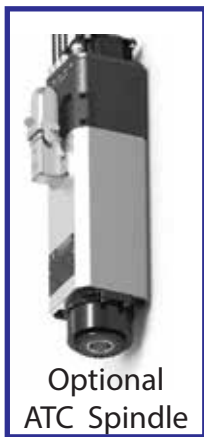
Optional ATC Spindle