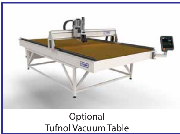
Optional Tufnol Vacuum Table